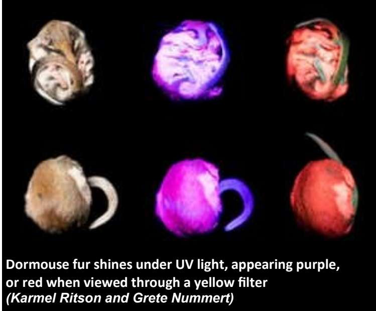
Dormouse fur shines under UV light, appearing purple, or red when viewed through a yellow filter (Karmel Ritson and Grete Nummert)

Garden Dormice may not seem particularly flamboyant. In fact, the small, brownish-white rodents spend much of their life trying not to be seen. But new research shows that under the right light, these animals shine with bright pinks and greenish-blues.