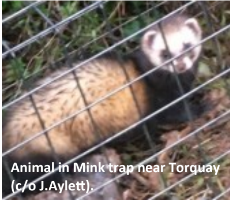
Animal in Mink trap near Torquay.

We have been hearing a lot about Pine Martens in recent years and there is good evidence that the species is slowly recovering areas of its former distribution, aided in part by reintroduction schemes. But what about the Pine Marten's smaller relative, the Polecat? The answer is that it seems to have been making a rather quieter comeback without the fanfare.