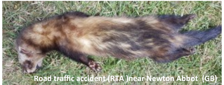
Road traffic accident (RTA) near Newton Abbot (GB)

Within the last 10 months, I had a spectacular early evening sighting of a Polecat running along a narrow lane in the South Hams. Then my ex-husband brought me a fresh road kill specimen (yes, really - see photo below) and I have had three more reports since then.