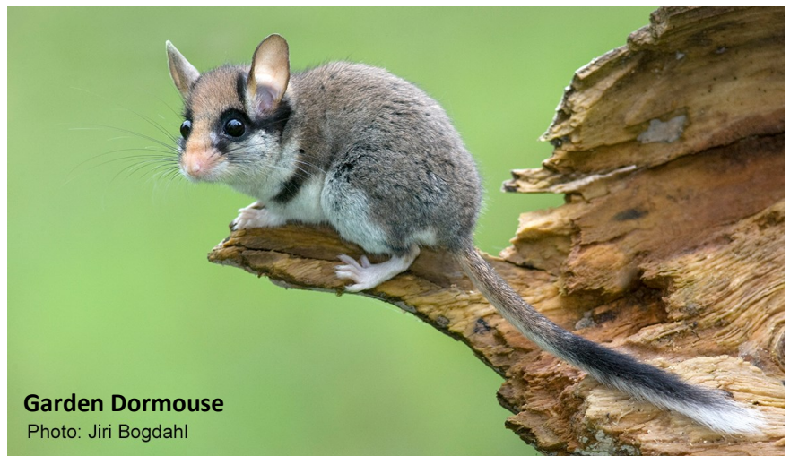
Garden Dormouse

“There is a whole world we cannot see,” says Nummert. “Animals perceive the world differently from us.”